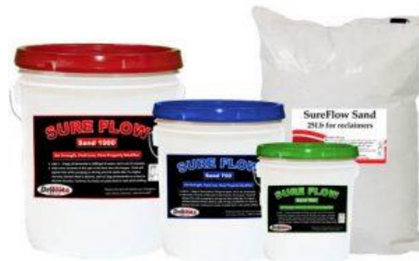
Viscosity/ Gel / Fluid Loss