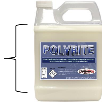
Viscosity / Lube